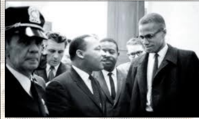
Malcom and Martin Split, 1968